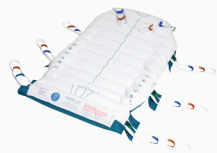
HOVERSLING™ Repositioning Sheet