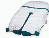
HOVERMATT™ SPU Split-Leg