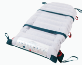
HOVERMATT™ SPU Link